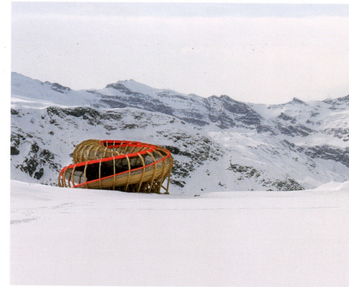
↑ Structure connected to its landscape ↓ By Lake Stelli