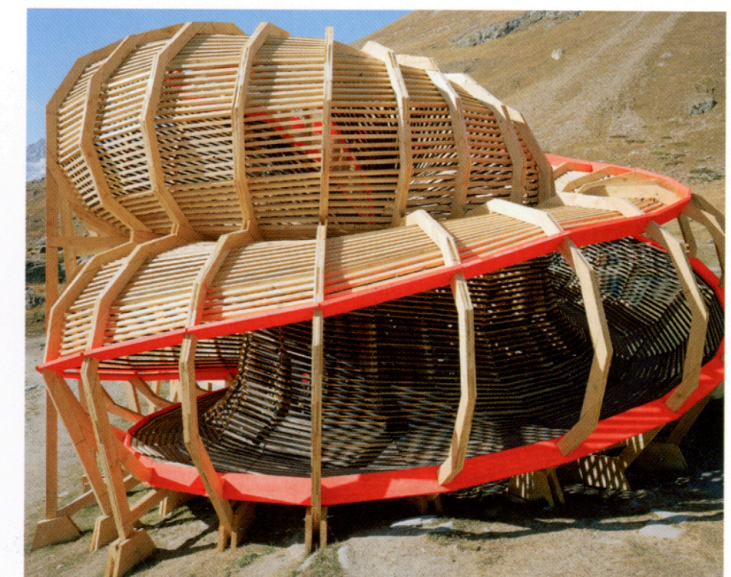
↑ Detail open wooden slats