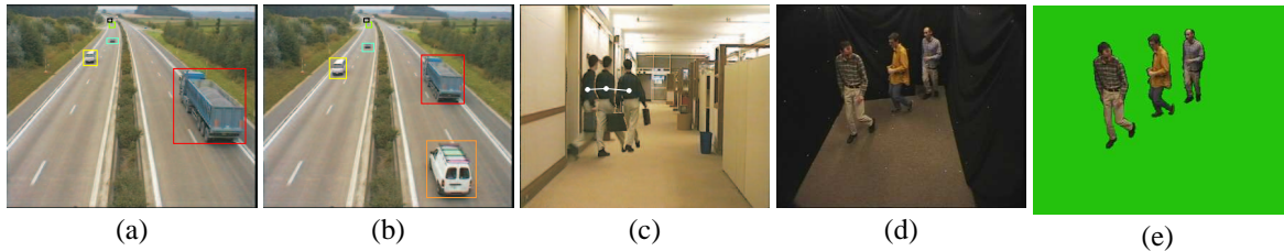
Figure 1: (a) and (b): samples of ground truth for tracking evaluation through bounding box for ‘Highway’ video sequence. (c): sample of ground truth for tracking evaluation through center of gravity for ‘Hall’. Sample of original video sequence ‘Group’ in (d) and the corresponding ideal object segmentation (ground truth) in (e).