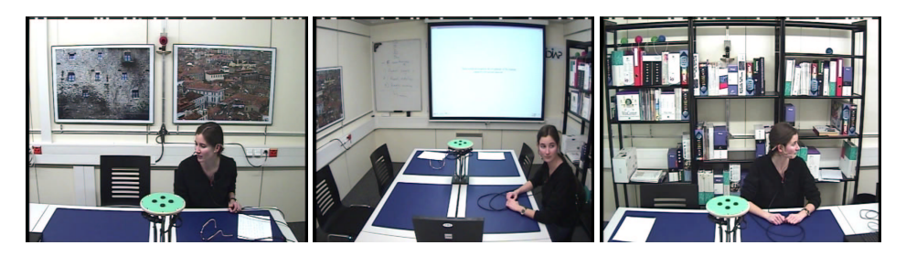
Figure 2: Right, center and left views of the meeting room

The major objective is to design a flexible database for realistic evaluation of component research areas in particular speaker localization, tracking, speech enhancement and recognition. The database consists of three major sections, first single speaker reading 1/6 sentences from 6 locations, second single speaker moving around the area of focus in the meeting room and the third pairs of overlapping speakers. To combat the effects of overlapping speech, which hinder the performance of speech recognition, the part of database is dedicated to the overlap speech. Each section comprises of 15 speakers hence resulting in a total of 45 recordings. The speakers were asked to read the phrases from the Wall Street journal (100 for each recording). The speakers were mainly non native English speakers and the recordings were as natural as possible with no constraints on speaking styles, accents and pronunciations. Around 20 hours of data including stationary, moving, overlapping speech was recorded.