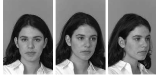
Fig. 2. Images of subject 01169 from the FERET database for 0^\circ , +25^\circ and +60^\circ views (left to right); note that the angles are approximate.