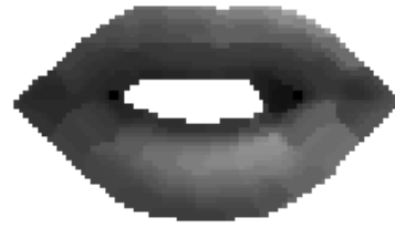
Figure 2: Reconstructed lips, using mean shape and mean profile parameters. The profile model also covers the area inside the mouth and a region about half the lip thickness wide extending the outer lip boundary which are not shown here.

The first few modes of shape variation are shown in Figure 1. The modes account for variation between speakers and variation due to speech production. Figure 2 shows reconstructed lips with mean shape and mean profile (the lip region was filled in by interpolating the grey levels between the profile vectors). The