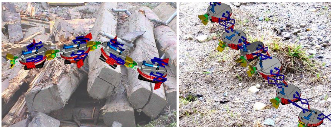
Figure 2: The rigid connection (left) can be used to form chains and pass very big obstacles and large gaps. The semi-flexible connection (right) is used to keep relative mobility between s-bots while they are in a swarm-bot configuration.

Semi-flexible connections are implemented by flexible arms actuated by two motors positioned at the point of attachment on the main body. The two degrees of freedom allow to extend and move laterally the arm. Each of these arms ends with a Velcro ®2 coated surface and can generate links with a complementary Velcro ® on the body of the robot. Rigid and semi-flexible connections have complementary roles in a swarm-bot. The rigid connection is mainly used to form rigid chains that have to pass large gaps (cf. figure 2 left), whereas the semi-flexible one suits configurations where each robot can still have its