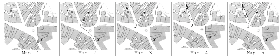
Fig. 1: Map references used in the transcript at Table 1

If we try to model the described situation using Clark and Shaefer's Contribution Model 1989 [5], or Traum's Grounding Acts Model 1999 [22], we reach the conclusion that A and B have grounded their conversation at each acknowledgment. More precisely: once both presentation and acceptance phases have been completed, the peers will have grounded a certain contribution (at utterance n. 4, 7, 9, 11). This architecture is based on the assumptions that the provision of evidences of reception is enough to infer the understanding of the signal and the corresponding incorporation in the contributor's beliefs. When using these models, it is difficult to explain a lack of understanding, as in the example provided when B leads to point "z", because B provided clearly evidence of acceptance as per message 4, on Table 1.