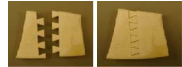
Example of structural joints [CAESAR]

We are developing a laser-based, non-contact cutting tool to perform osteotomy without mechanical stress and vibrations. With respect to conventional mechanical approaches, the laser method reduces procedure invasiveness while significantly increases cut accuracy and precision. Furthermore, the development of a positioning system will allow 3D cuts that are currently impossible with a saw.