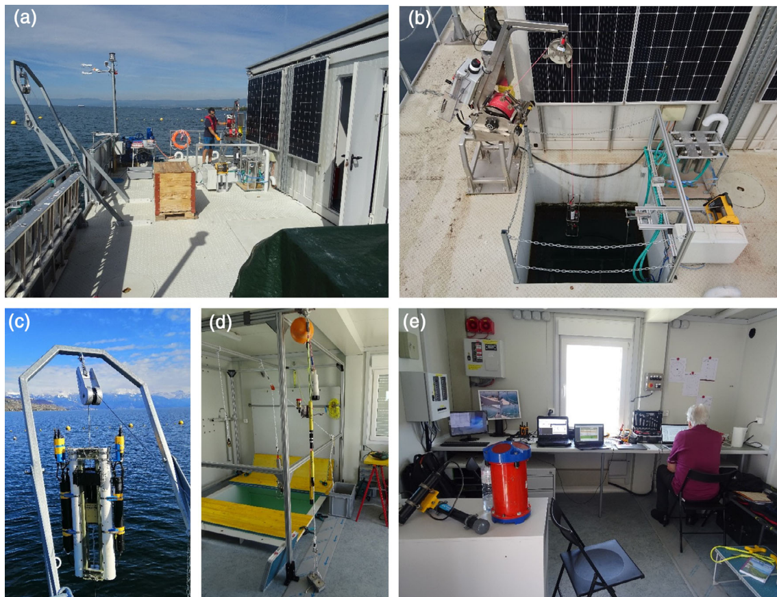
FIGURE 2 LéXPLORE elements (from top left to bottom right): (a) outdoor work area, (b) outdoor moonpool with electric crane (left) and pump system (right), (c) Wirewalker deployment using an A-frame, (d) partially covered indoor moonpool, and (e) office work area

contribute to uncertainties in piston velocities including (a) lateral and temporal variability of wind forcing, (b) interactions of wind-induced and cooling-induced turbulence, and (c) fluctuations in surface wave-affected gas transfer (Deike & Melville, 2018; Reichl & Deike, 2020). In addition, the scale of vertical and temporal variations in gas concentrations in the upper few tens of centimeters of the water column (Watson et al., 2020) and sub-daily variation in near-surface stratification and gas transfer velocity from intermittent wind, waves, and heat fluxes can obscure detection of forces driving gas transfer. These dynamics demonstrate that both concentration gradients (driving force) and turbulence levels (transfer velocity) vary considerably over short time scales of less than a day. Gas fluxes represent the instantaneous product of these processes and thus vary on the same time scales.