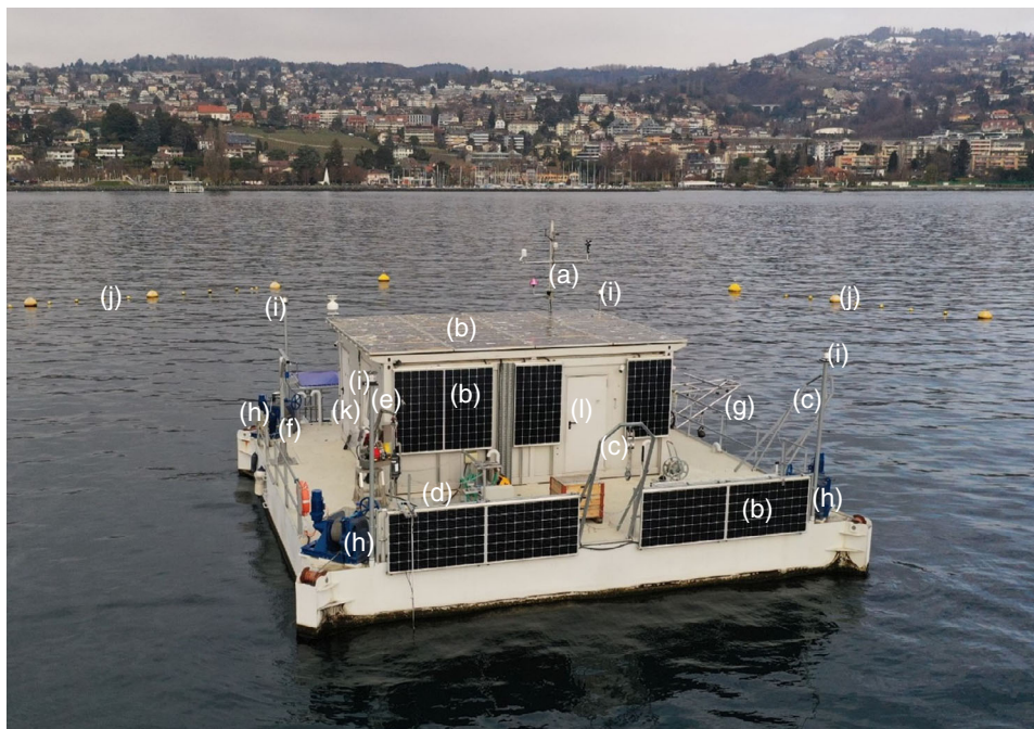
FIGURE 1 Side view of LéXPLORE from the south with the town of Pully in the background. The image shows the sheltered laboratory and exterior meteorological instruments (a), solar panels (b), on roof and towards south, two A-frames (c), the outdoor moonpool (d) with electrical winch (e), support frame for lifting loads (f), and the structure maintaining a thermistor chain (g). Blue anchor winches with cables for positioning rest at all four corners (h) and are mounted with navigation lights (i). The two doors access the toilet (k) and the laboratory (l). Battery banks and diesel-generator rest inside the pontoon-hull. The yellow buoys delineate the safety perimeter (j) for instrument protection.

high-quality wave and wind measurements that capture directional fetch-limited frequency spectra of wind-generated waves (Donelan et al., 1985).