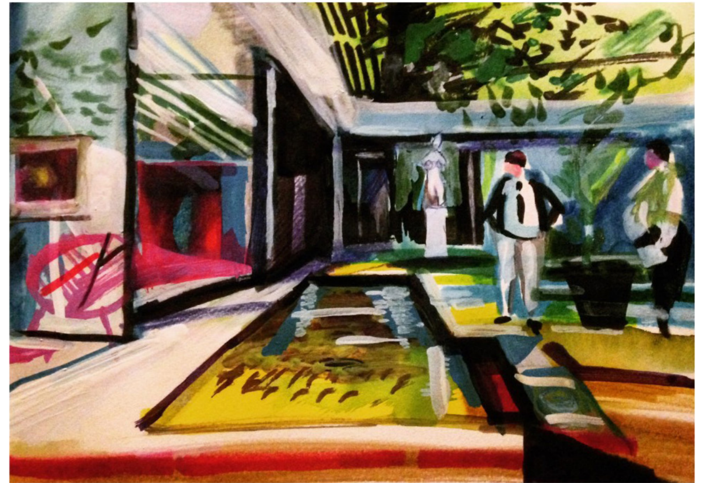
"Portraits of Domesticity"