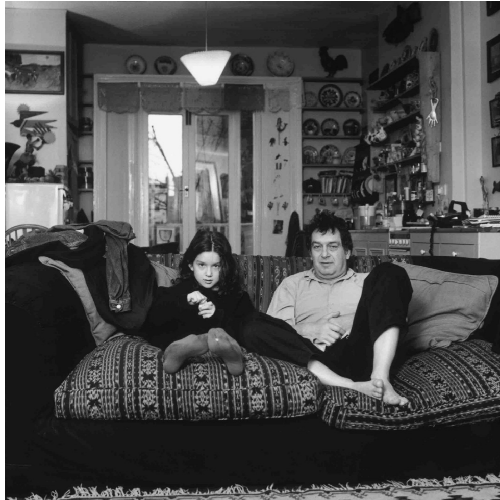
"Black and White Portraits" & "Bird's Eye View"