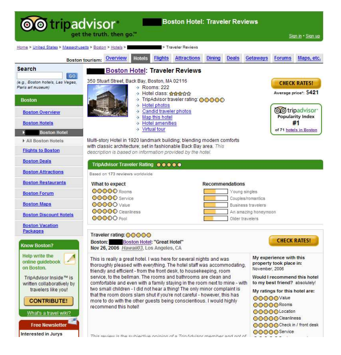
Figure 1: The TripAdvisor page displaying reviews for a popular Boston hotel. Name of hotel and advertisements were deliberatively erased.

and the reviews that preceded it. A perusal of online reviews shows that ratings are often part of discussion threads, where one post is not necessarily independent of other posts. One may see, for example, users who make an effort to contradict, or vehemently agree with, the remarks of previous users. By analyzing the time sequence of reports, we conclude that past reviews influence the future reports, as they create some prior expectation regarding the quality of service. The subjective perception of the user is influenced by the gap between the prior expectation and the actual performance of the service [17, 18, 16, 21] which will later reflect in the user's rating. We propose a model that captures the dependence of ratings on prior expectations, and validate it using the empirical data we collected.