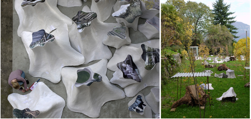
Fig. 4. Wildwood I, Studio Vulkan, Architecture Forum Lugano, 2014 (left) Photos of Studio Vulkan's projects mounted on papier-mâché tree trunks and displayed in the garden over six winter months. (right) The decay of the landscape project photos, which took many years to design and build, taken over by nature herself, decaying over the course of the exhibition.