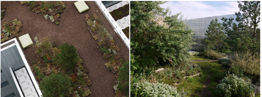
Fig. 5. Toni Areal Roof Garden, Studio Vulkan, Zurich, 2015 (left) A highly unnatural natural place – a pre-cultivated garden in boxes creating an instant garden on call. (right) On opening day of the school the boxes began their process of decomposing. Plants break out, becoming wild and turning the rooftop into an uncontrolled, overgrown setting.