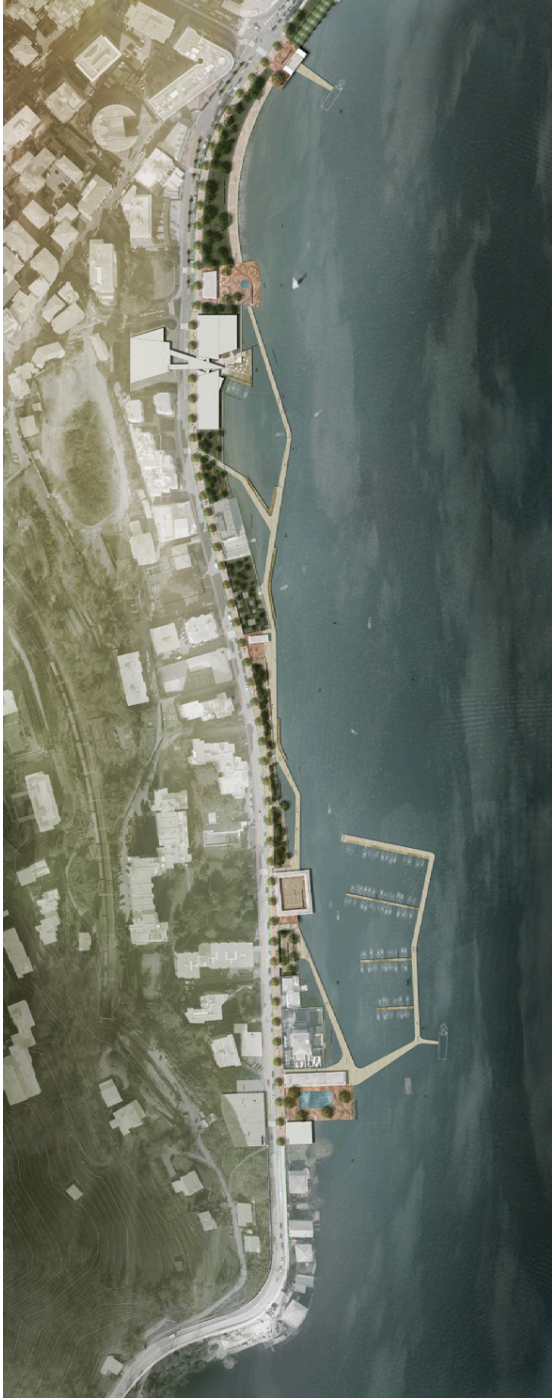
Fig. 3. Waterfront Promenade Lugano Paradiso, Studio Vulkan, Lugano, 2016 The promenade reconnects the town with its lakeshore, unfolding a sequence of varied spatial connections between land and water: toward, across, along, at, above, on, to and in the water.