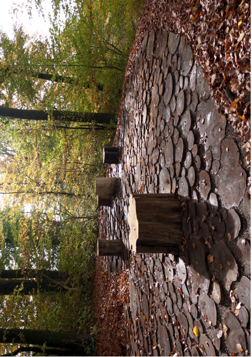
Fig. 6. Wildwood Plaza, Studio Vulkan, Zurich, 2014 Woodlands offer a diffuse, intangible spatial experience of landscape.