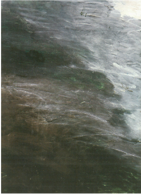
Fig. 1. Goethe In Italy III, Cy Twombly, 1978 Twombly's painting leaves the reading of the image to the mind's eye. With no hierarchy or focus, the eye gazes again and again at the painting, creating a new imaginative reading with each viewing.