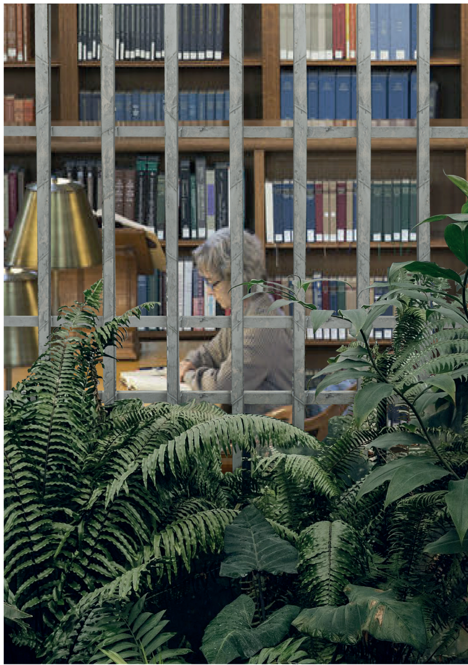
7 Cour 00 vers Garden Room 000 Collage d'idée / 238 x 335