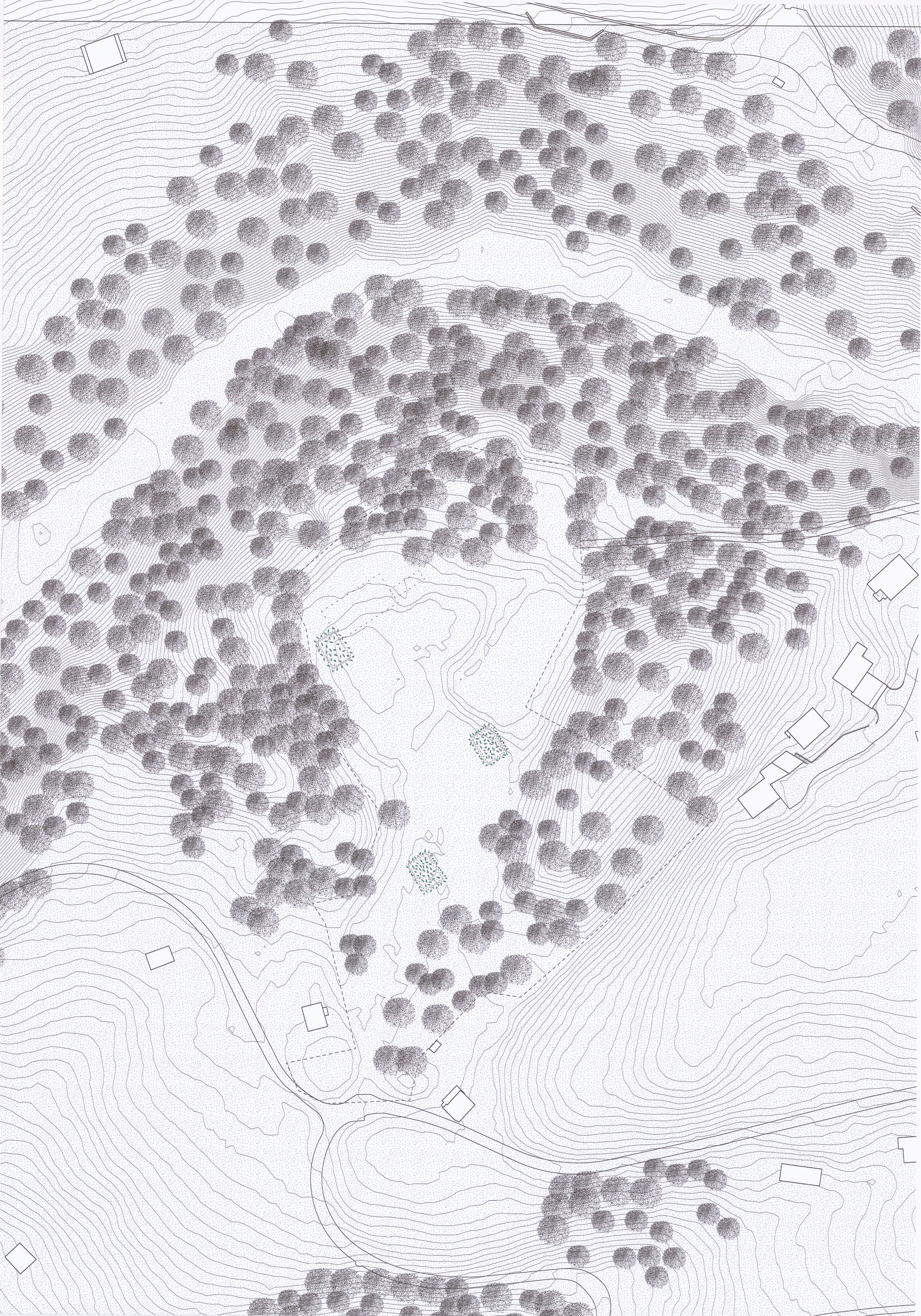
Plan masse 1:500