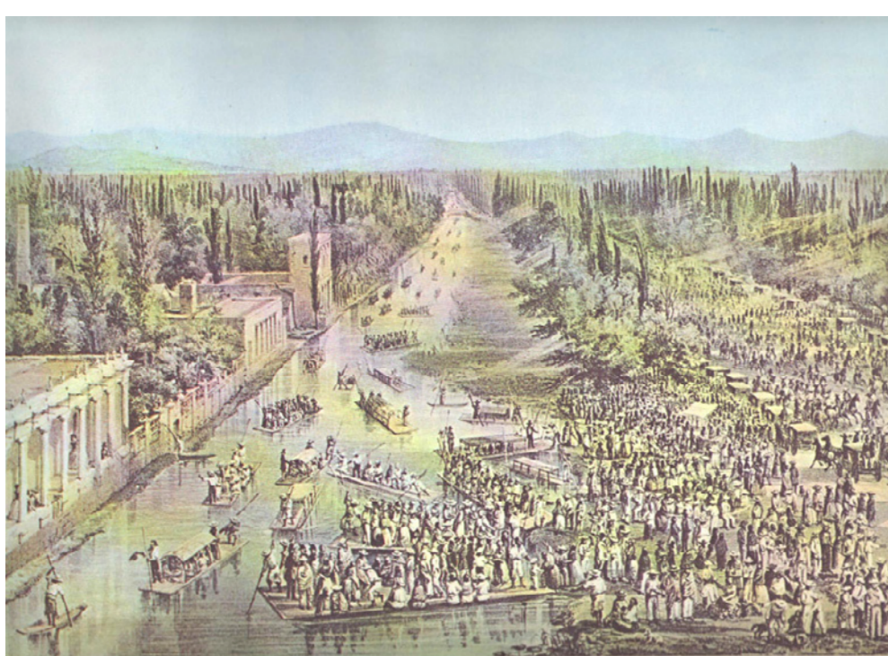
Canal de la Vega, 1905