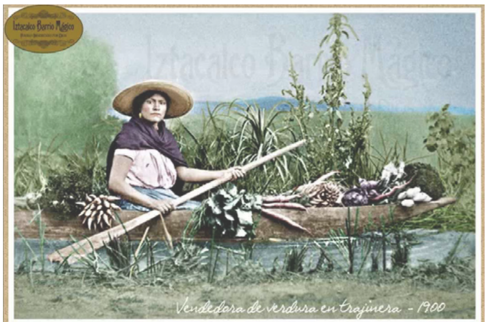
Vegetable seller in a Trajinera, Xochimilco, Ville de Mexico, 1900