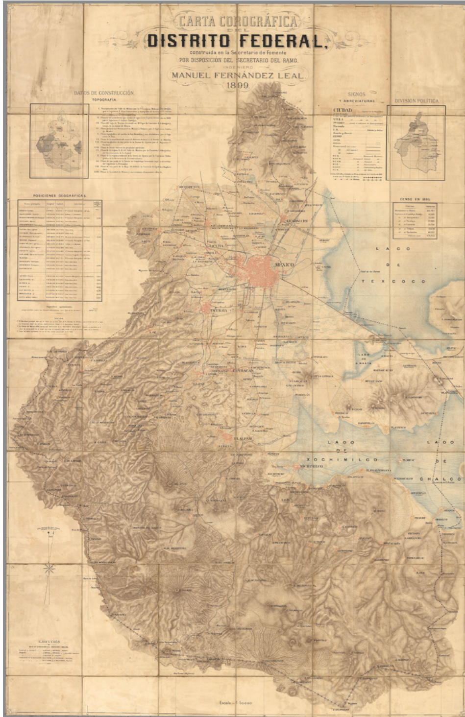
Map of Mexico City, 1899