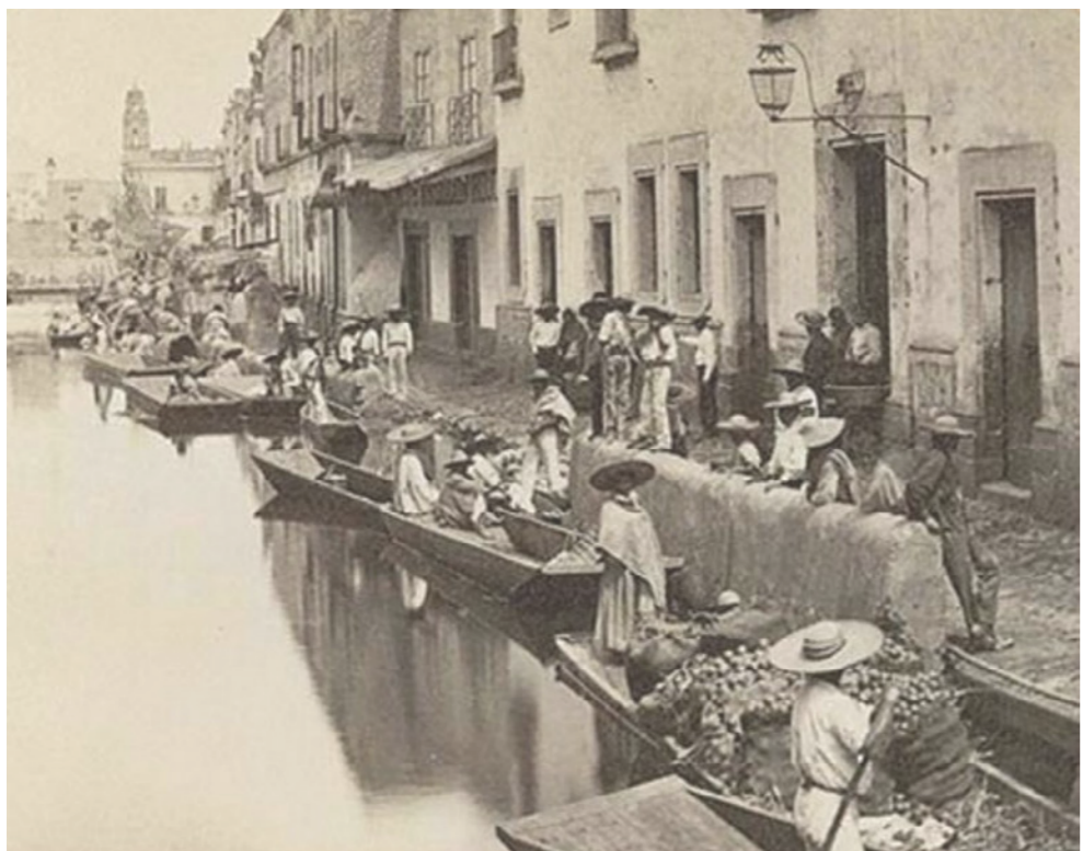
Canal Market, Mexico City, 1878