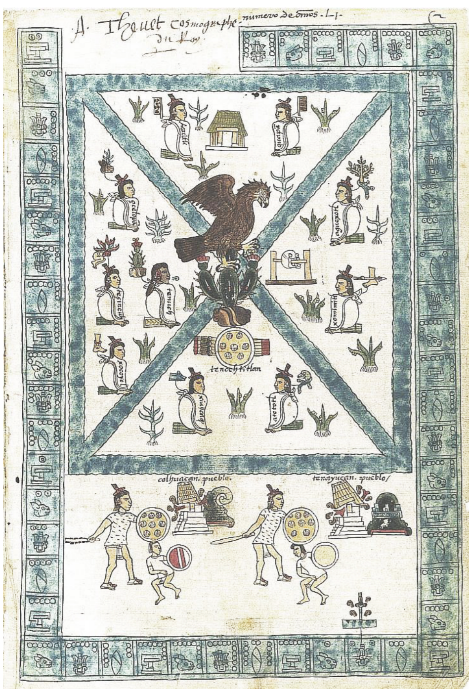
Indigenous Map of Tenochtitlan, 1541