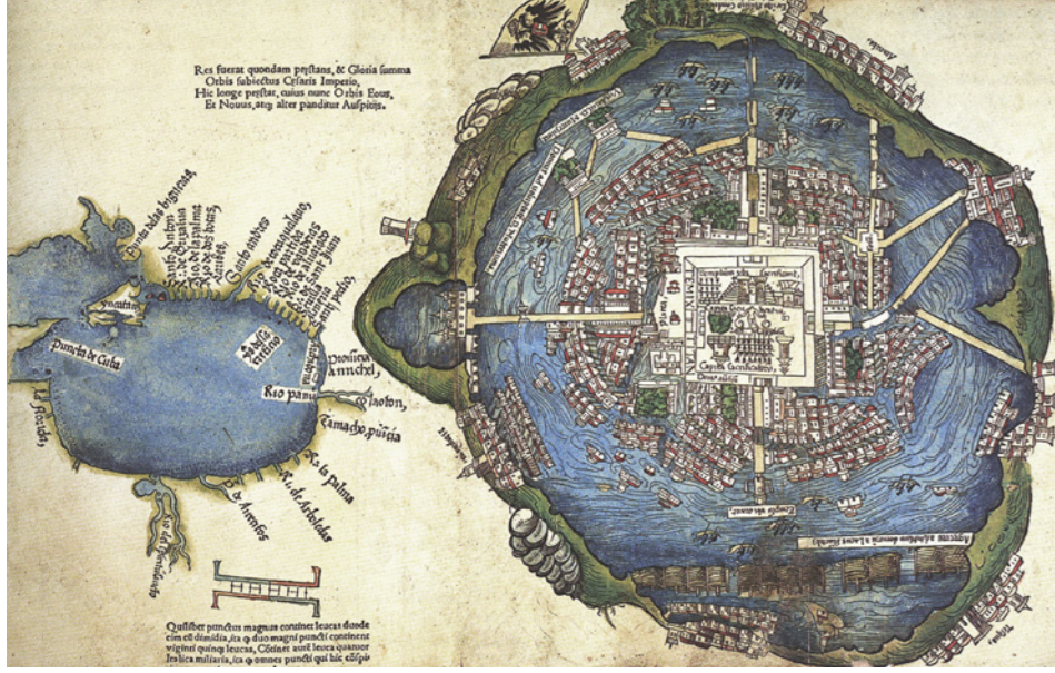
Cortes Map of Tenochtitlan, 1524