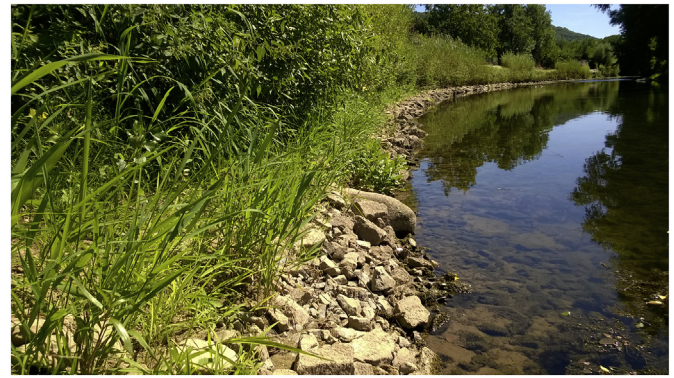
Fig. 5. Design of bioengineering structures along riverbanks can be thought for allowing them to provide both slope stabilization and ecological restoration.

The Blue infrastructures (BI) framework is also a good illustration of the complex questions facing bioengineers. Worldwide, two contrary eco-geomorphological management practices co-exist for rivers. In