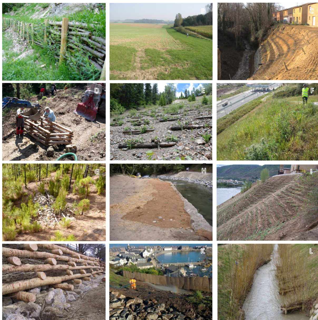
Fig. 1. Examples of bioengineering structures and installations worldwide. A. Palissades (France); B. Grass buffer strips (Belgium); C. Green steel structure and log branch/dormant cuttings after completion (France); D. Prefabricated wooden structure (Italy); E. Modified brush layers (Canada); F. Sowings with straw mats and vegetated bench (Portugal); G. Mixed check dam (Canary Islands); H. Planting with willow cuttings and coconut tissue (Switzerland); I. Brushlayer, straw and wattle (Canada); J. Vegetated crib wall (Austria); K. Hydroseeding (Scotland); L. River modeling (Austria).

2004; Stokes et al., 2004). Bioengineering is a well-recognized component of ecological engineering, itself defined as “the design of sustainable systems, consistent with ecological principles, which integrate human society with its natural environment for the benefit of both” (Mitsch and Jørgensen, 2003; Mitsch, 2012). Bioengineering is used to: (i) control natural hazards (e.g., Norris et al., 2008; Dhital et al., 2013), (ii) restore or reintroduce plant and animal species onto