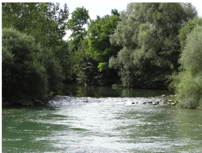
Fig. 6. Rough rock ramp with integrated fishway, providing positive action for both riverbed stabilization and fish movement.

bioengineering actions in the future can be summarized as: (i) considering a multidisciplinary approach for soil and water bioengineering projects, (ii) establishing practical guidelines and tools for designing bioengineering structures, (iii) implementing monitoring stages in bioengineering projects, (iv) transmitting knowledge and know-how on soil and water bioengineering, (v) analyzing existing bioengineering works in terms of their performance, successes and failures, and (vi) continuing to identify the needs of the bioengineering professional sector.