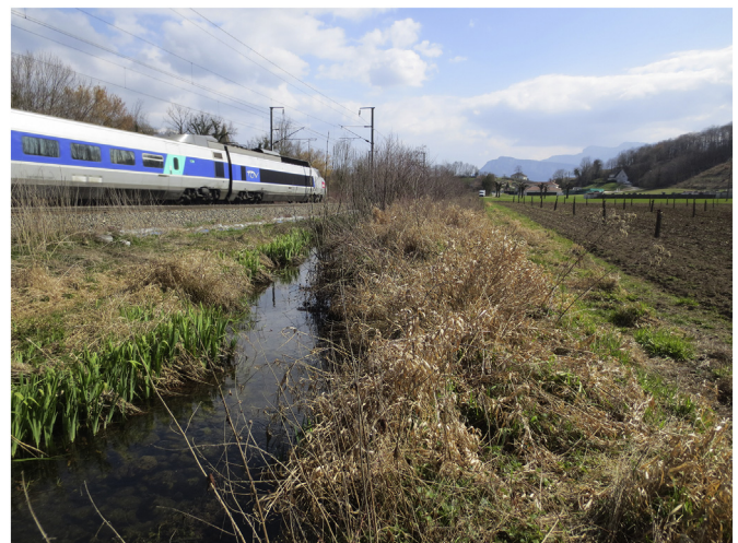
Fig. 2. Which bioengineering structures to use to restore this degraded stream while protecting the railway against floods? (photo: F. Rey).

One of the currently pressing challenges is to define bioengineering actions for a range of different situations. Although techniques are well described (e.g., Schiechl and Stern, 1996, 1997; Gray and Sotir, 1996; Zeh, 2007; Florineth, 2007; Hacker and Johanssen, 2012; EFIB, 2015), quantitative recommendations on how and which materials to use in specific situations are lacking, especially when the objective is to reconcile natural hazard mitigation and ecological restoration. To overcome this knowledge gap, scientists should heed practitioners' needs through discussions during projects, conferences or training, and conduct research at different spatial scales, with specific objectives in mind (Fig. 3).