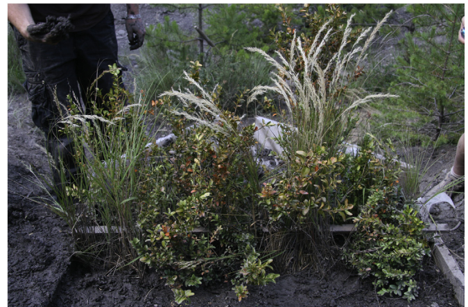
Fig. 4. Biodiversity can have a negative effect on sediment trapping performance of vegetation barriers, as monospecific barriers involving one very performant species are more efficient than plurispecific ones including more or less efficient species.

The choice of the appropriate structure to use in a bioengineering project largely depends on the objective. When considering natural hazard control, the first principle to follow is to use structures and plants that have sufficient mechanical resistance to withstand gravitational or hydrological forces linked to the hazard process. Firstly, although technical drawings describing structures and their mechanical resistance exist in guidelines, we do not necessarily know their origins and performance or reliability for the myriad of field situations likely to be encountered (Schaff et al., 2013). With the exception of gravitational structures (e.g. crib walls and fascines), whose design procedures are well established, and apart from a few cases (e.g. brushlayers and river-bank protection, Bischetti et al., 2010), most bioengineering techniques have not yet been sufficiently studied. At the individual plant scale, it is not well known to which topographic (e.g. Bochet et al., 2009; Nadal-Romero et al., 2014) and hydrological forces plants resist before failing,