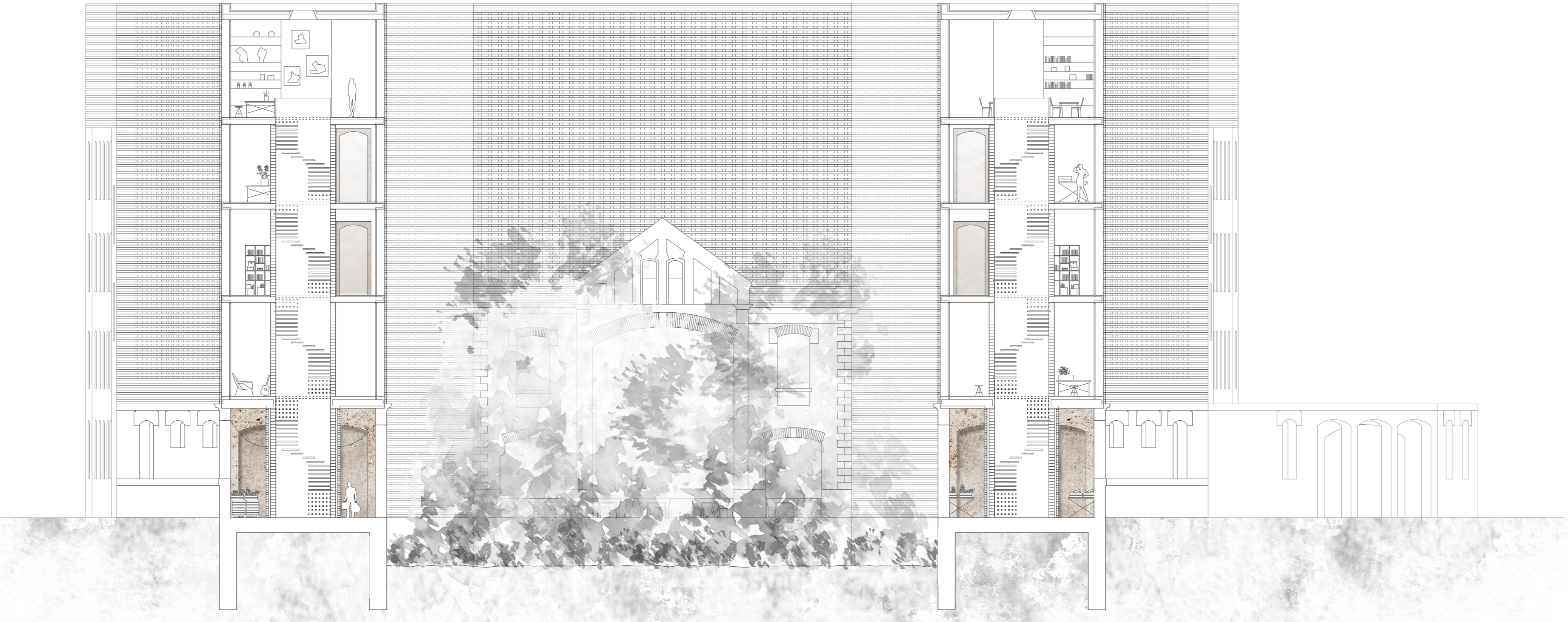
COUPE TRANSVERSALE B