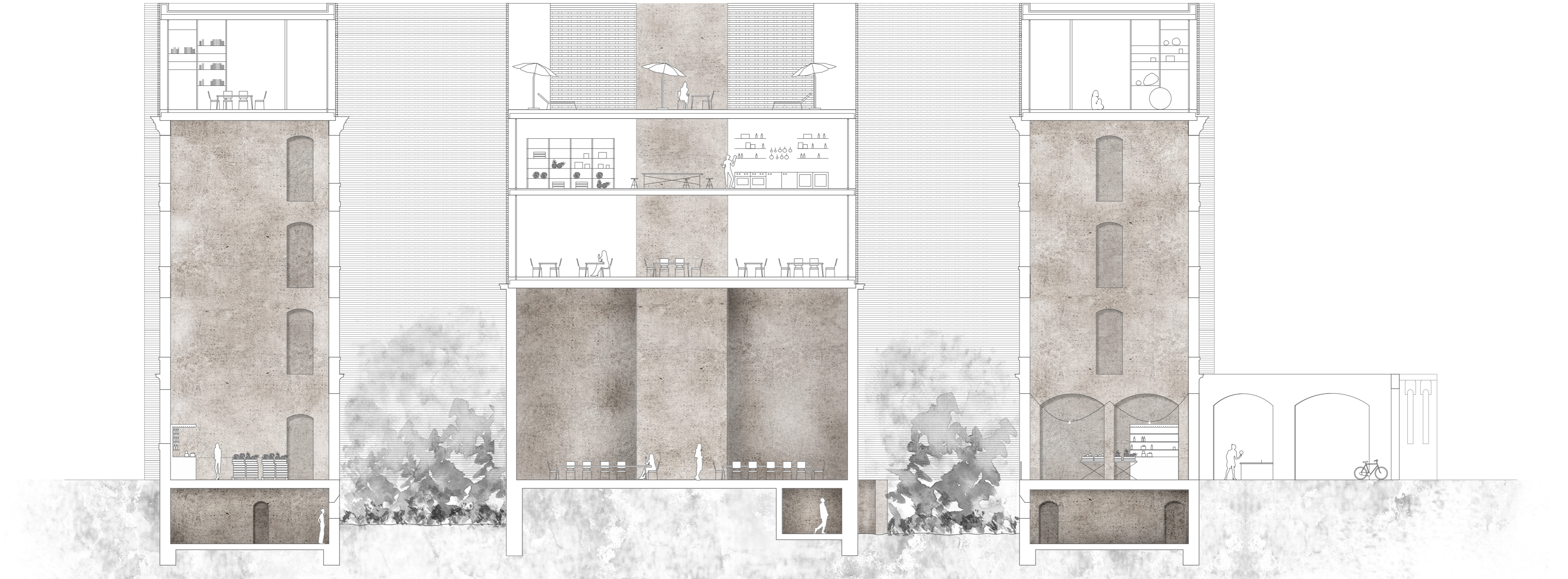
COUPE TRANSVERSALE C