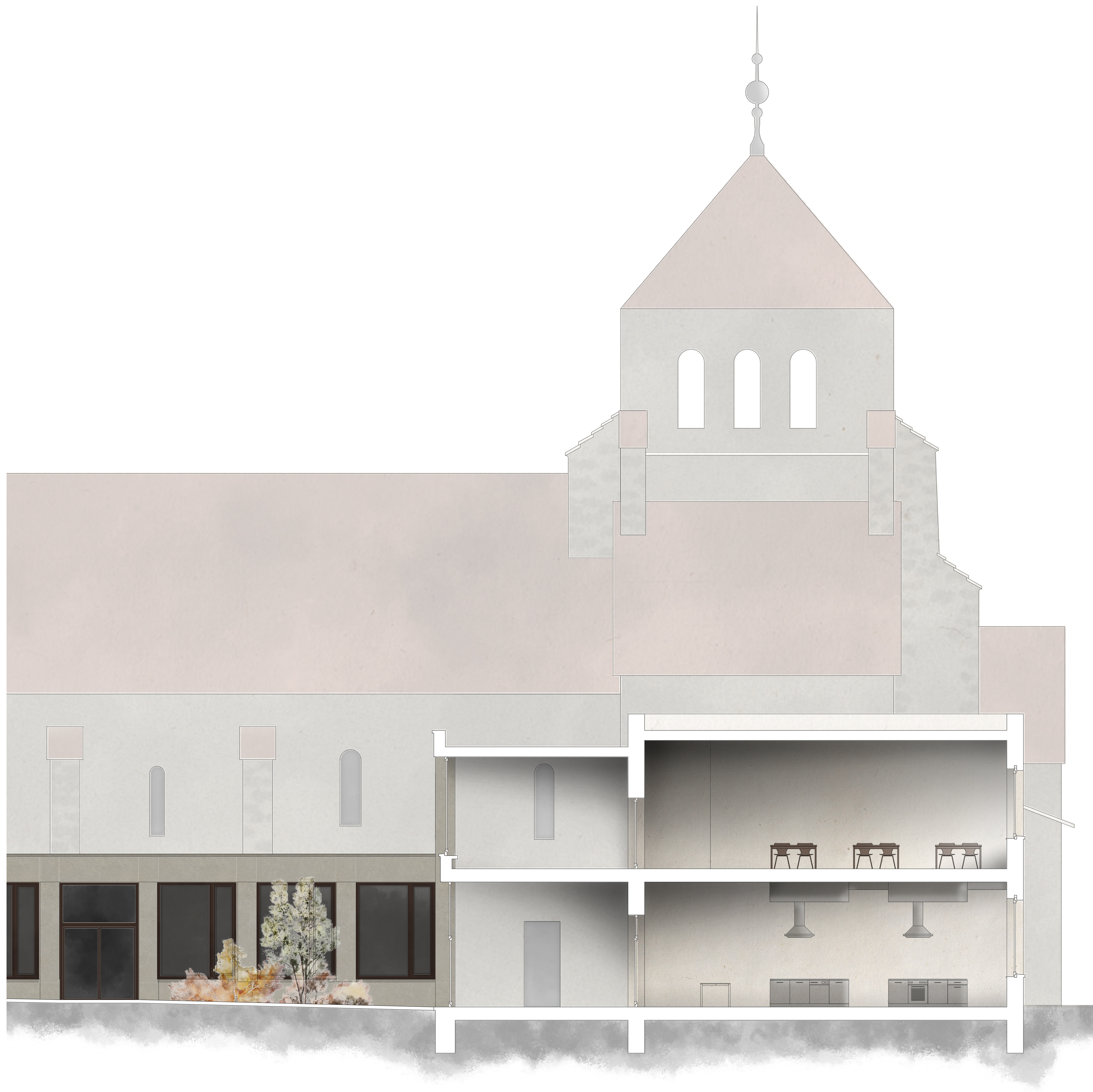
Coupe transversale 1:50