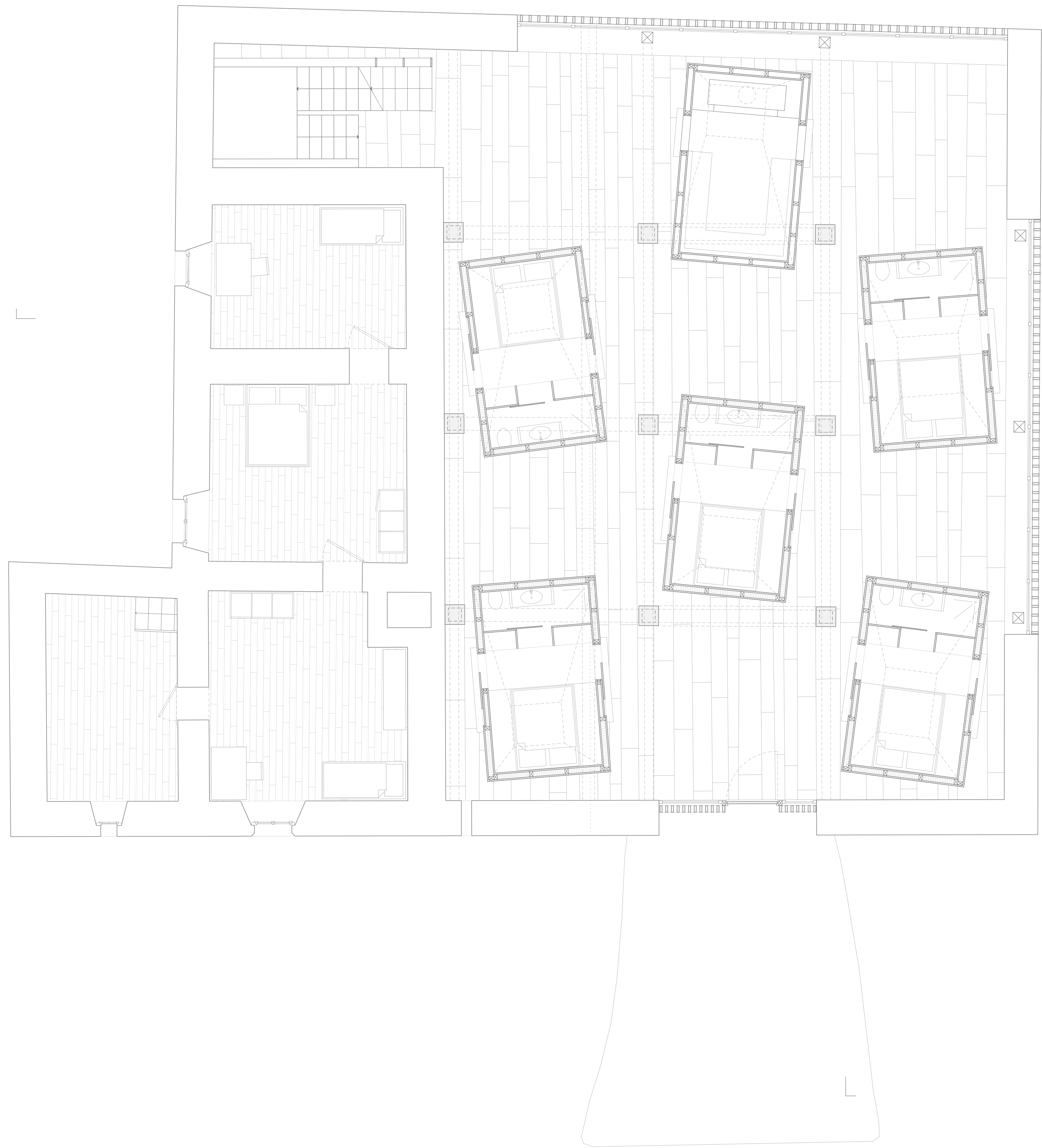
1er étage | 1:50