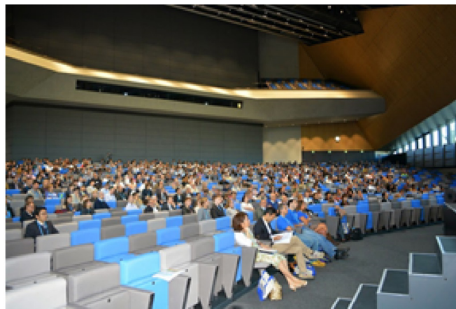
View of the main Conference Hall