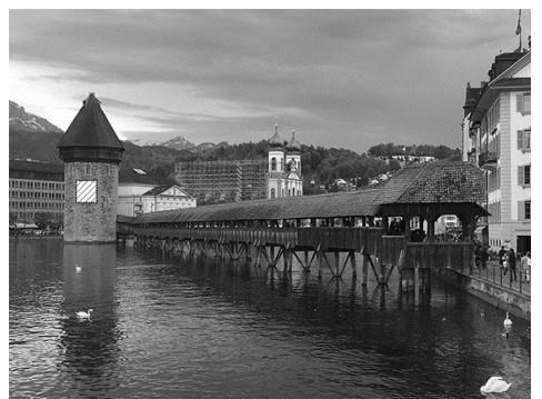
Figure 3. The white square represents the locations where Photovoltaics of different colors were added.

This paper studies the visual changes caused by differently coloured PV modules in this view, as purely hypothetical installations. A square PV module was painted into the image region showing the tower, indicated as the white square in figure 3. Other parameters than the colour such as location and details (joints, mounting, cables etc.) were omitted.