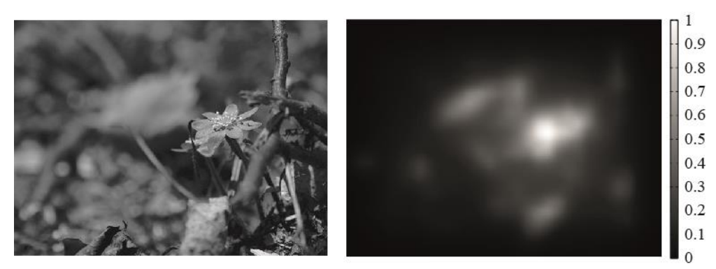
Figure 1. An example of the saliency map application. It is possible to use a photo as an import into the saliency map tool. The photo is considered to be a snapshot of the human visual scene. Even though the proportion of the Harel & Koch map's default setting is 900 x 1200 pixel, but in reality the proportion does not matter due to saccade movement in the human eyes.

the object is from the centre of the image (e.g. the leaf down-left), the more it tends to be suppressed.