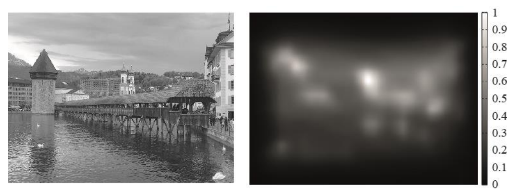
Figure 2. The image "as is" (left) and its saliency map "as is" (right).

In order to find out the visual changes and their corresponding quantified descriptions, representative heritage views was chosen for the investigation. Visual changes in this paper always referred to the difference of the view perception of the scene in figure 2 ("as is" situation) before and after the PV installation. Figure 2 shows the Kapellbrücke in Lucerne Old City as an application example because it could best demonstrate how a scenic view is very sensitive to an extrinsic PV installation that did not belong here originally. The sensitivity was also amplified by the fact that the PV was installed on a precious heritage building.