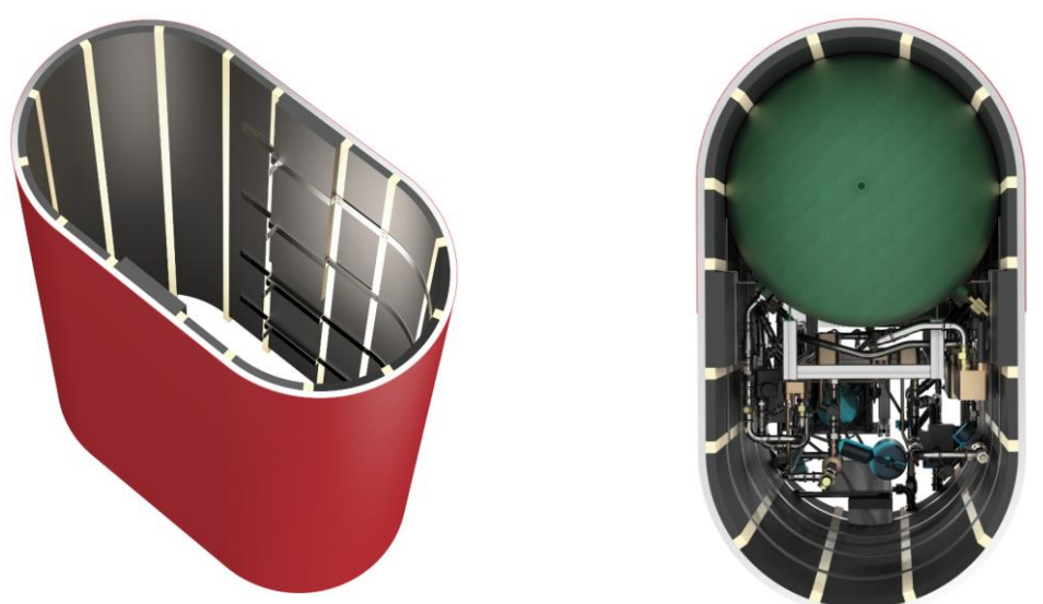
Figure 1: Design of the insulation of the system shown without hydraulic components (left) and with components (right).

Unique on this system is that all hydraulic components such as pumps, valves, heat exchangers and the heat pump itself are under the same VIP insulation as the storage unit. Thus, a very compact system can be built with a high degree of pre-fabrication, resulting in much faster and less fault-prone installation in the field. Figure 1 shows the design concept of the system.