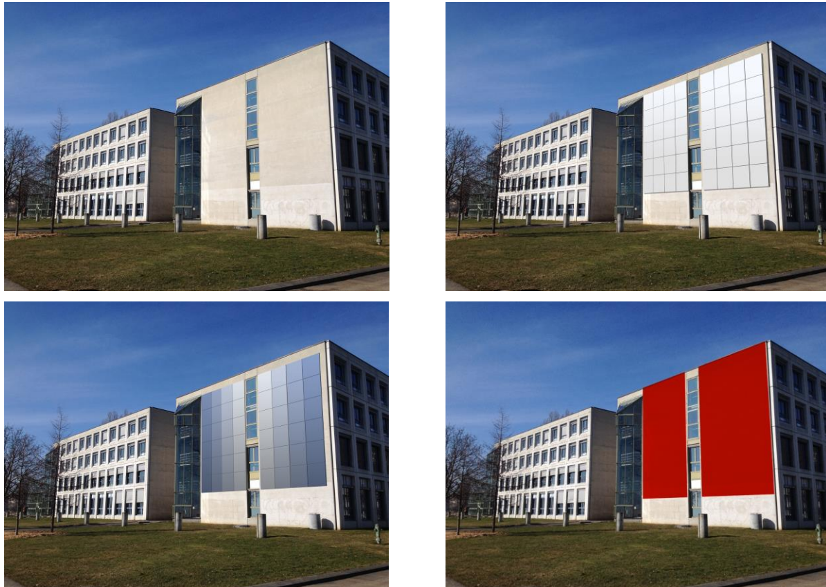
Photo 4a-d: Before and after. The CSEM technology offers virtually an endless variety to design future PV-façades (simulations).

Besides its high BIPV potential the CSEM developed optical filter can be applied in many other fields like consumable electronics (laptops), displays, security (cameras), signage, watch and car industry etc. The next steps for CSEM are to raise the efficiency of white PV modules above 13% and integrate them into new applications.