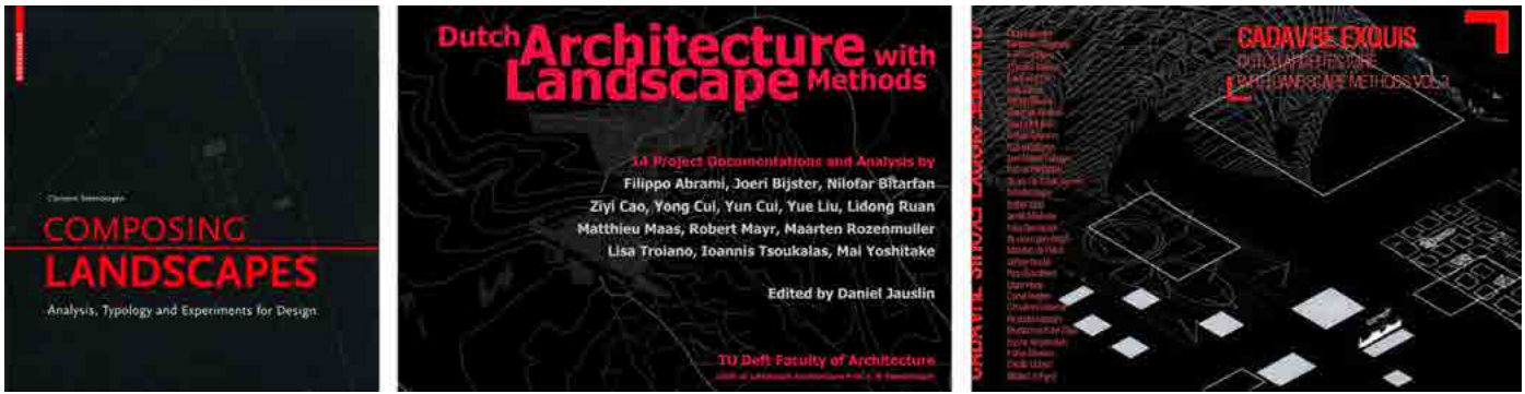
FIGURE 2. Composing Landscapes/Dutch Architecture with Landscape Methods vol.1/Cadavre Exquis vol.3 (Sources: Birkhäuser / TU Delft / RavB )