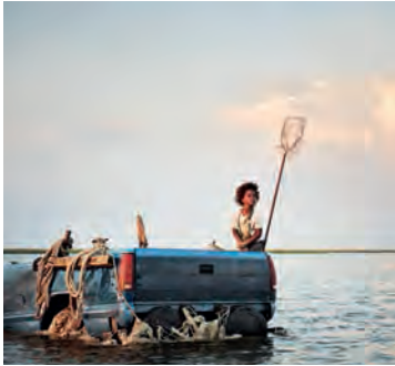
Beasts of the Southern Wild, Seville International

64 The story of the six-year-old Hushpuppy in the film “Beasts of the Southern Wild” refers to the degraded landscape of the Louisiana marshlands.