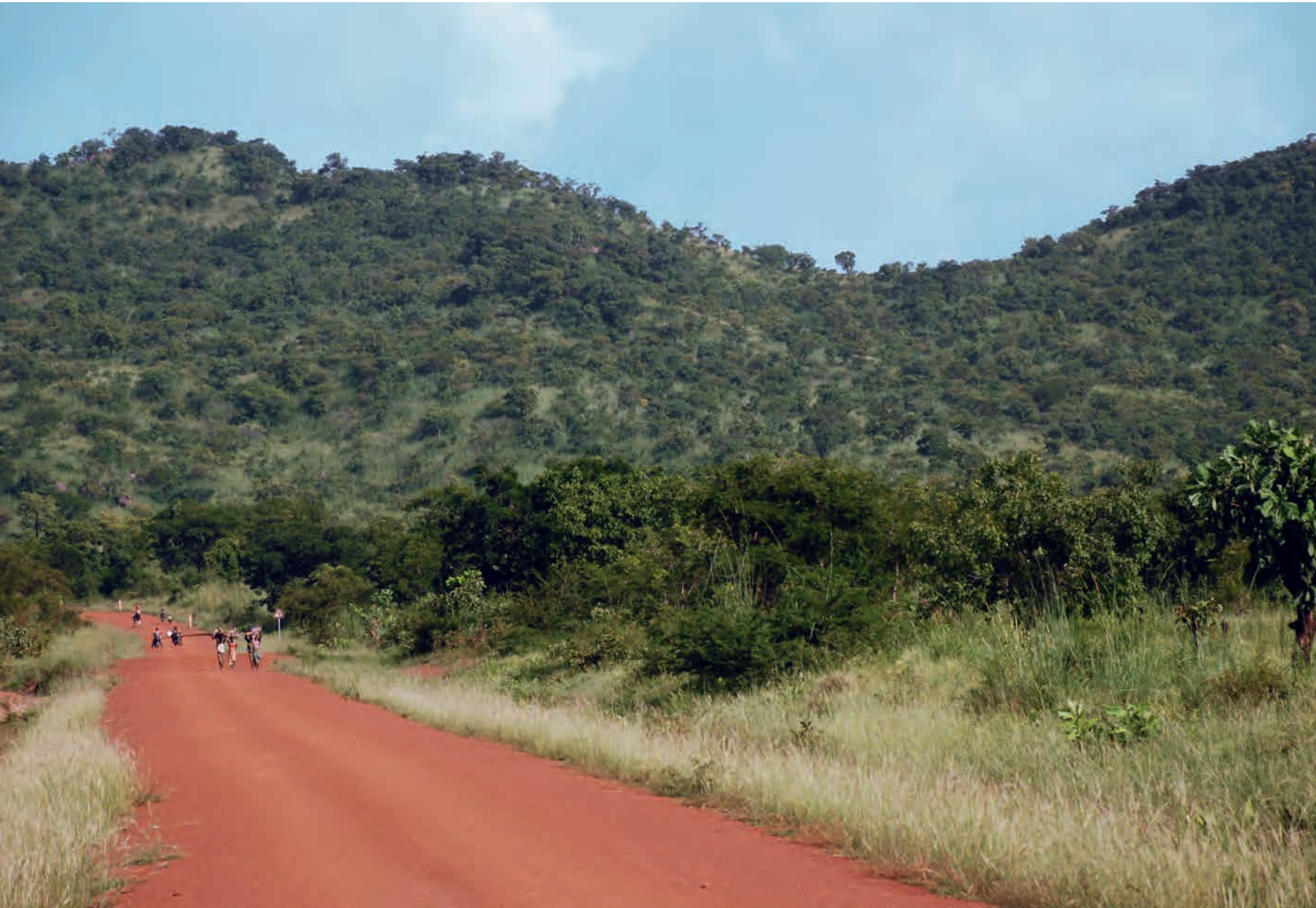
Soil tells the narrative of Africa. The photo shows a dirt road in Atakora Province, Benin, West Africa – close to the border of Togo, looking southward (2007).