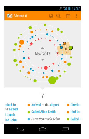
Figure 3: Monthly overview.