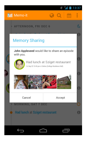
Figure 5: Sharing memories between users.

of user activities. This view allows the user to have, in a glimpse, an idea of when she was active the most (size of the circles) and for what kind of activity (life events, social interactions, phone events).