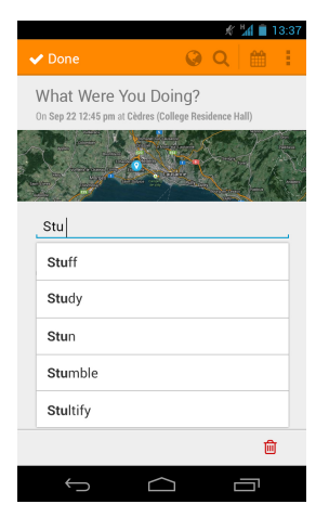
Figure 1: Creation of a new EE. Selection of a verb from the ontology.