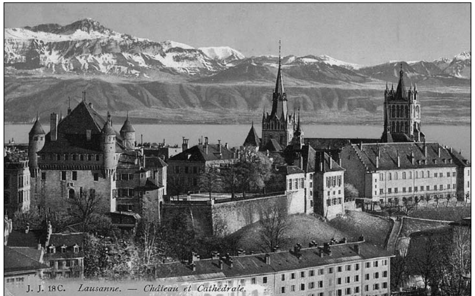
Fig. 1 'Château et Cathédrale' at the beginning of the 20 th century. The Academy building is the long-roofed one, in front of the bell-tower of the cathedral.