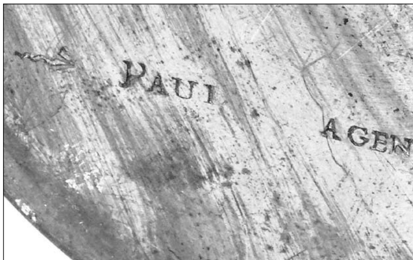
Fig. 3 Maker's signature on the bottom.