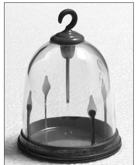
Figs. 2 Paul – de Saussure electroscope. Base diam. 70 mm; height 70 mm.

Back to Geneva in 1776, he was admitted to citizenship ('Bourgeoisie'), free of charge, without having to pay the sometimes very high admission fees, in recognition of his exceptional talent, and its usefulness for the prosperity of the city. For the Govern-