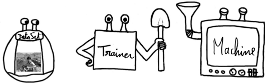
Figure 1: Original concepts from Torch: DataSet, Trainer and Machine. the Trainer uses data from the DataSet to train a Machine.

through the use of a common open-source software framework, the vision of Bob is to improve the reproducibility of publications across the multimedia research field into the future.