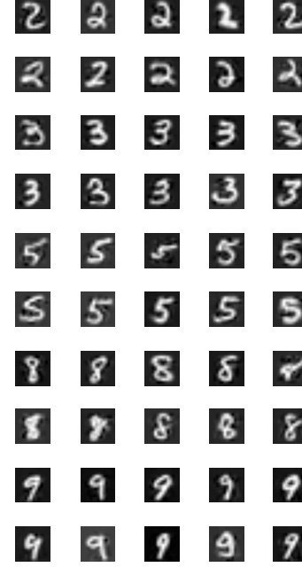
Fig. 3. Atoms learned with KSVD

we initialized both algorithms with estimates of the transformation parameters computed by aligning the training images with respect to a reference image from each class, we have also observed a very similar difference between the performances of DLFC and KSVD. The sensitivity of the learned dictionaries to parameter estimation errors can possibly be overcome by integrating the alignment in the dictionary learning, which remains as a future direction of research. Figures 2 and 3 provide a visual comparison between the outputs of DLFC and KSVD respectively, where 10 sample atoms are shown from the dictionary of each class. While the atoms learned with KSVD are only approximative of their own class, the atoms learned with DLFC are seen to also include components that increase their distance to the samples of other classes, improving thus the distinction between different classes.