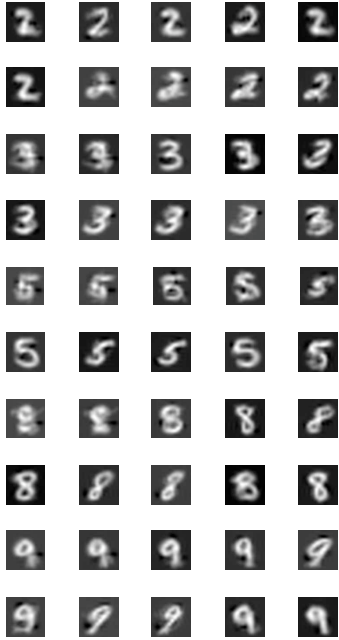
Fig. 2. Atoms learned with DLFC