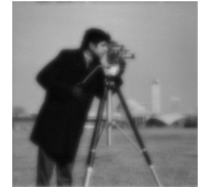
(a) Blurred noisy measurements