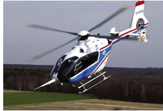
Figure 3: Flying Helicopter Simulator.

A common methodology is used to study these questions by defining example scenarios. These scenarios will simulate the design of a PATS in different geographical contexts. The main focus of the myCopter project is on using a PAV for