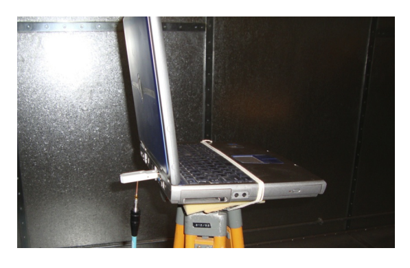
Fig. 2. Reverberation chamber setup for measuring the radiation efficiency of the antenna connected to a laptop computer.