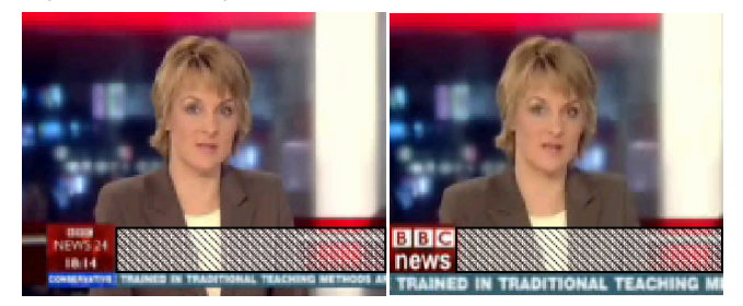
Figure 1: Content before (l.) and after (r.) editing steps. Text inserts appeared in the hatched area.

In order to obtain content with an aspect ratio of 4:3 and an enlarged ticker we cropped off 36 pixels from the left, 14 from the right and 14 from the bottom (the part below the ticker). The logo area, which contained both the logo and a clock, was overlaid by a bigger version containing only the logo. News headlines that appeared temporarily in the area to the right of the logo were overlaid with bigger font size versions that were still legible at the smallest resolution (120x90). The area below the logo that featured a word to contextualize the ticker text was used to extend the space for the ticker. Varying lengths of the original ticker line were used such that in the final version the text ran across the whole horizontal length of the picture. The height of the ticker line ranged from 9 to 12 pixels for the four resolution sizes with the respective text height of the capitalized text ranging from approximately six to eight pixels. At a viewing distance of 40cm this resulted in a viewing angle of the ticker text of 11 arc minutes for the smallest image size. The rest of the picture was slightly condensed in the vertical dimension to accommodate the ticker. This allowed for comparisons of results with [6] since the amount of presented information was approximately equivalent (compare Figure 1 left and right).