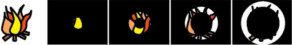
Figure 1: An example of circular segmentation and concentric cropping of an image into 4 concentric regions.

We encompass all the edge-pixels with a circle of center \{x_c, y_c\} and radius r_c . In order to compute the center we first calculate the extrema points of the Edge-Set as follows: