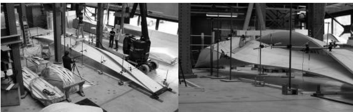
Figure 6. Real scale testing on textile modules

As we attempt to optimise prototype structures for specific parameters, the first set of observations that need to be made are systematic comparisons between the initial structure and deformed structure for every given structural proposal or geometry. Geometrical and mechanical observations