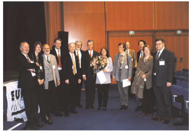
Fig. 3. The EuMW 1998 team with some EuMA officers after the closing ceremony.

Figure 4 shows the evolution of EuMC in terms of number of papers presented: after the initial growth of the first three editions and the 1974 drop when the conference became annual, the size remained approximately the same for several years