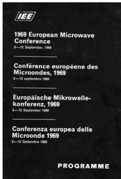
Fig. 1. Advance Programme of the first EuMC, London 1969.