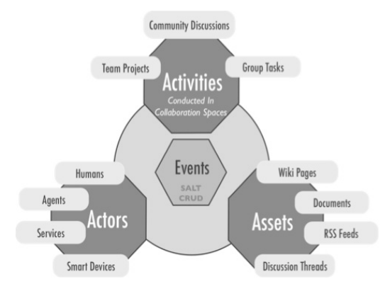
figure 4. 3A model corresponding to the internal representation of the aggregated data. This model can be used to derivate an ontology for exporting/importing data.

The model comes from activity theory, distributed cognition and actor network theory. It has 3 categories of entities: Actor, Activity and Asset (aka 3A).