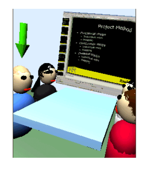
Figure 2: Snapshots of 2D and 3D interfaces.

upon reception of an element, it renders the corresponding graphical element directly to the GUI. If the annotation consists of a URI of a document (a captured slide for example), the application retrieves the document from the document server and displays it in the user interface.