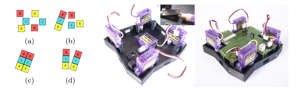
Fig. 1. Left: (a–d): illustration of the growth and replication process. Center/right: generic hardware prototype capable of simulating all aspects of the e-, i-, and b-modules. Center: squared base with four connection sides. The inset shows a hatch in the bottom plate, which controls the mobility of the module, which floats on an air table. Right: fully assembled prototype (battery removed).

growth phase, it deactivates its two lateral connection sides. As a consequence, the modules form polymers (i.e., linear chains) of arbitrary length. Once a b -module connects to either end of such a polymer, a signal propagates to the other end, and thereby a membrane is established (see Fig. 1b). The membrane prevents further extensions on either side of the polymer during its lifetime. The self-assembly process thus results in linear organisms that are composed of \geq 1 e -modules, \geq 0 i -modules, and 1 b -module.