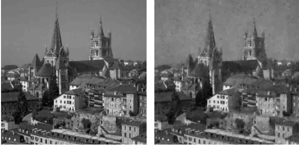
Fig. 2. (left) Original Image. (right) Reconstructed image with M = \lfloor \bar{N}/3 \rfloor , from noisy measurements quantized on 11-bits. PSNR 27.3 dB.

here n_i \sim N(0, \sigma^2) with \sigma^2 = \sigma_0^2 + \sigma_{ADC}^2 + \frac{\Delta^2}{12} and \sqrt{\sigma_0^2 + \sigma_{ADC}^2} = \|\Phi x\|_\infty / 100 .