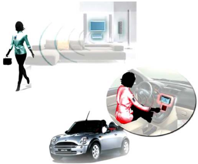
Fig. 1. Visionary scenario

Chloe prepares herself to go out while listening to her preferred music. She transmits orally her program of the day as well as her itinerary to her electronic agenda, which is somewhere in the house. At the time of leaving, she puts on her INTERMEDIA jacket. At this moment, all the data of each multimedia device are transmitted automatically to her jacket (e.g., the itinerary which she intends to follow this morning and her music selection, see Fig. 1). Chloe gets into her car. The information contained in the jacket is transferred to the electronic device in the car: the car radio