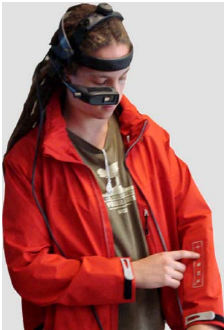
Fig. 2. User interacting with the i-jacket

500 monocular see-through head-mounted display (HMD) and an ultra-mobile PC (UMPC, Sony Vaio UX70) as shown in Fig. 2. The decision of using MR instead of augmented-reality (AR) has been motivated by the relatively poor results yet achieved in the field of mobile indoor tracking. Indeed, techniques like pedestrian dead reckoning (PDR) [2] or Bayesian localization framework using WiFi signals [6] does not give satisfying enough results to ensure the registration process needed for convincing AR.