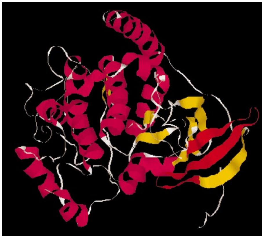
Figure 1. A search on the PDB database with the PROSITE pattern PS00107 (directed against the ATP binding region of the kinase domain) was performed on the ScanProsite page. The pattern identified 221 matches. The 1CTP entry was selected to visualize the position of the pattern on the 3D structure. The ATP binding region is highlighted in red. The ScanProsite page uses RasMol (16) scripts to produce images. An interactive view with the Chime program is also provided.