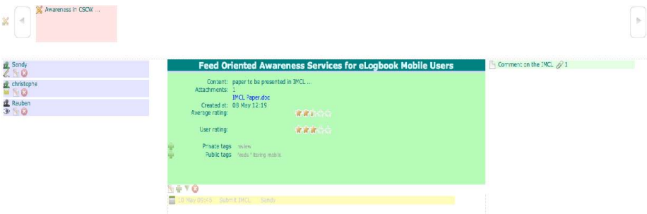
Fig. 3. Example of the context-sensitive view, the focal element being an asset