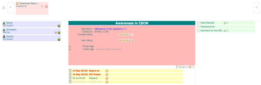
Fig. 2. Example of the context-sensitive View, the focal element being an activity.