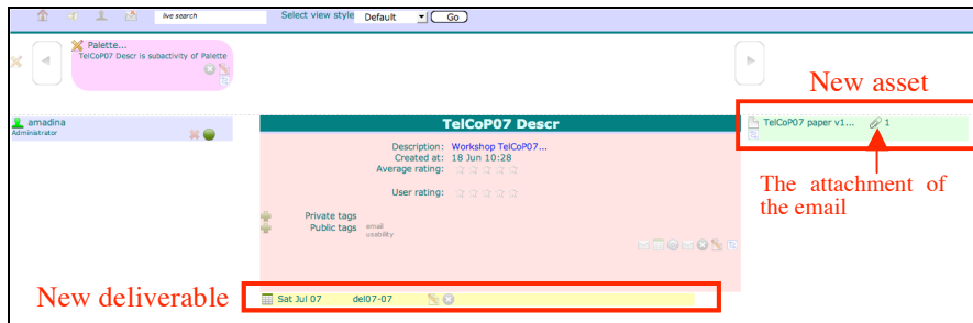
Fig. 9. Context view of the activity “TelCoP07”. A new deliverable is created.