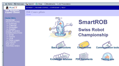
Figure 2: Web environment.

new robotic platform, called SmartEase PC104 (figure 1). This platform has the advantage of having an on-board standard PC running QNX as real-time operating system.