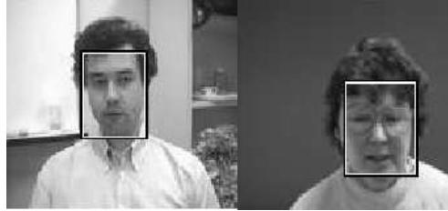
Fig. 2. Face detection on BANCA [16] examples.

the discrimination capabilities are improved because of the possible presence of noise and outliers in the dataset. In order to have a structure more adapted to the datasets, we are now working on more specialized experts, for example by using a clustering in eigenfaces space based on a more appropriated metrics.