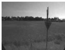
Photos 1 & 2. The identification a road sign can be difficult

We currently investigate the implementation of a tool combining GPS and a digital camera, to update the inventory of road signs in a semi-automatic way with: