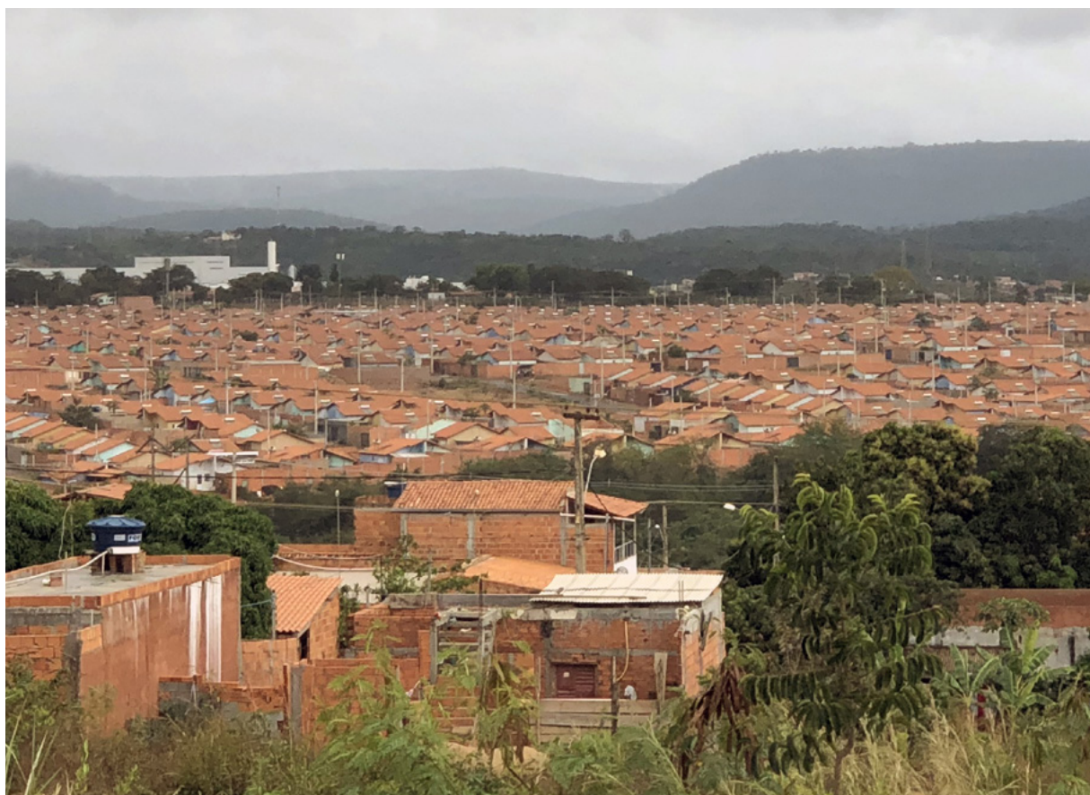
Figure 1: Montes Claros, Brazil