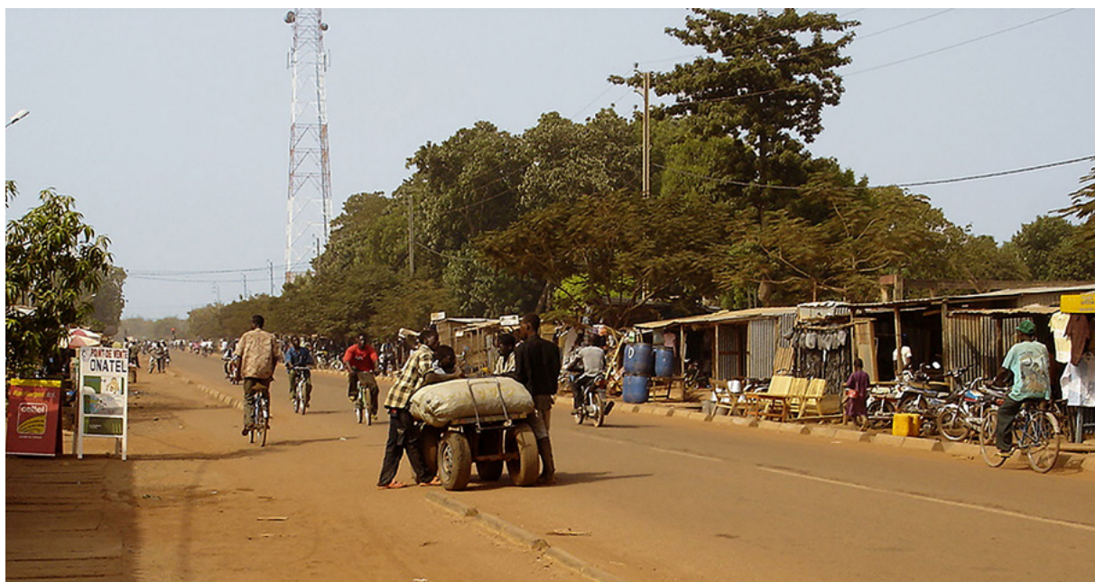
Figure 2: Koudougou, Burkina Faso

these two questions is nonetheless divergent. The former avoids delving too deeply into societal complexity and instead seeks technical solutions to improve the city's functionality (infrastructures, networks, communication routes, equipment, etc.), too often forgetting the universal need for accessibility (i.e. for the poor as well). The second makes citizens the focus by recognizing the fact that integrating people socially, economically and culturally fosters sustainable, inclusive urban development. In this sense, urban planning in South cities is too often incomplete at the spatial level, as experts only focus on specific parts of the territory and typically abandon poor, poorly-regulated and outlying neighborhoods. This approach is also poorly adapted socio-economically speaking, as it tends to focus on business districts and the "select" areas that privileged social actors invest in, based on their financial status, relationship to power or even community or ethnicity.