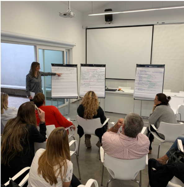
Figure 9, 10: Workshop in Pehuajo, Argentina

Training, communication and dialogue play a key role in planning and they should do the same in implementation. Here, too, there is room for innovation, starting with social practices and human dynamics outside of the formal context at the local and regional levels. When the indispensable technical know-how of urban and business experts is absent inhabitants are forced to take matters into their own hands and wind up doing the job (building homes, community facilities, better managing their neighborhoods, etc.) themselves, sometimes with poor results. The collaboration of all citizens should be neither overlooked nor set aside, for they are the very heart and soul of a participatory process that includes not only consultation, but conception and action as well. Rather, these forces can be incorporated into the planning process, where they can be useful in the implementation of collective decisions.