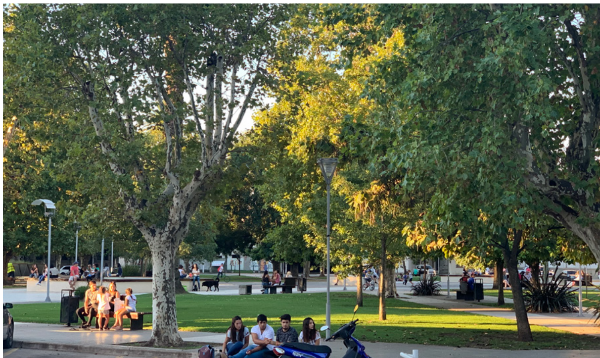
Figure 19: Pehuajo, Argentina