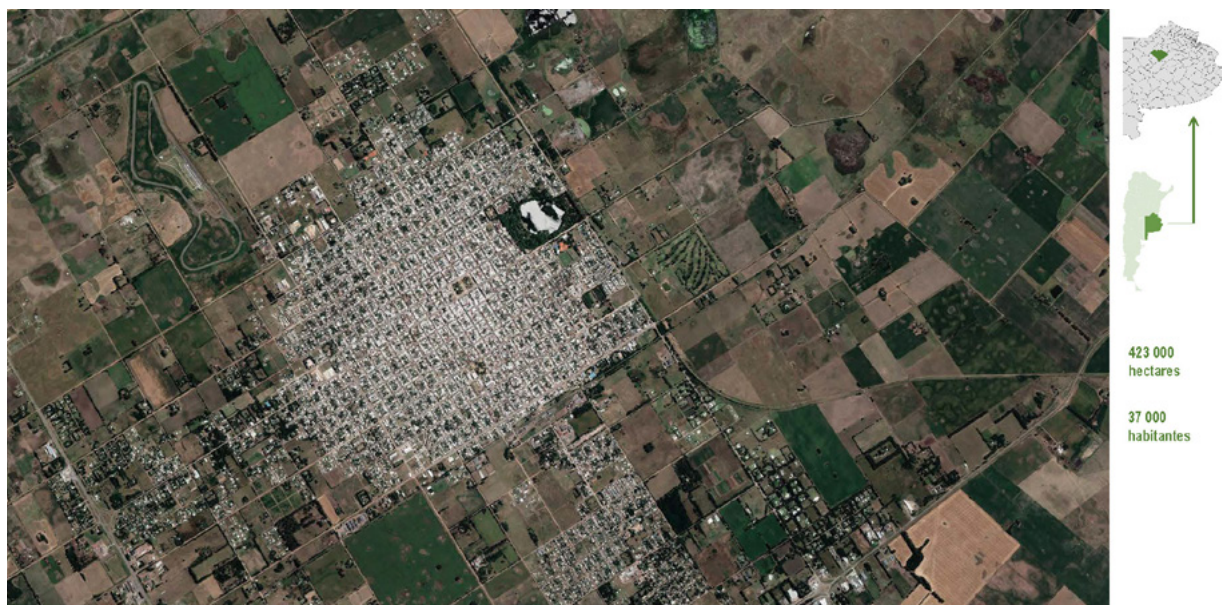
Figure 13: Localization of Nueve de Julio, Buenos Aires Province, Argentina.

dated plan of the networks or a mapping department. These departments were also understaffed. In 2018, Municipality of Nueve de Julio had a single urban planning unit with only two architects. The reference planning document was a zoning plan, a non-versatile urban planning tool that does not convey a project or a vision of the city's development.