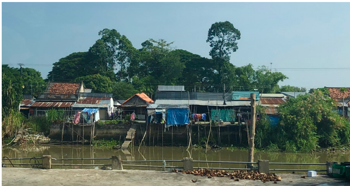
Figure 3: Chau Doc, Vietnam (Photo by J-C Bolay, 2018)

of reference and as experimental sites (Edensor & Jayne, 2012). Reproducing these recipes in different urban contexts is simply nonsensical and can only offer ineffective solutions. The management of public facilities and services is a good example. Today, the privatization of the latter is a major trend. Hence, the profitability of urban investments and their management takes precedence over their "universality."