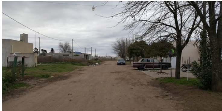
Figure 4-7: "Ciudad Nueva" neighborhood, Nueve de Julio, Argentina (photos by Teo Vexina Wilkinson, CODEV, 2017)