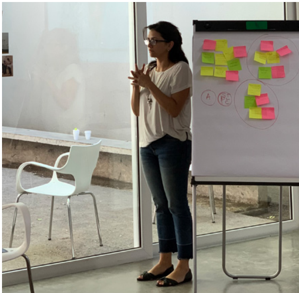
Figure 11, 12: Workshop in Pehuajo, Argentina

The first project phase assumed that the urban planning tools available to the municipality were not adapted to the urban and social needs/reality. We found that the city's planning department possesses little data nor did it have an up-