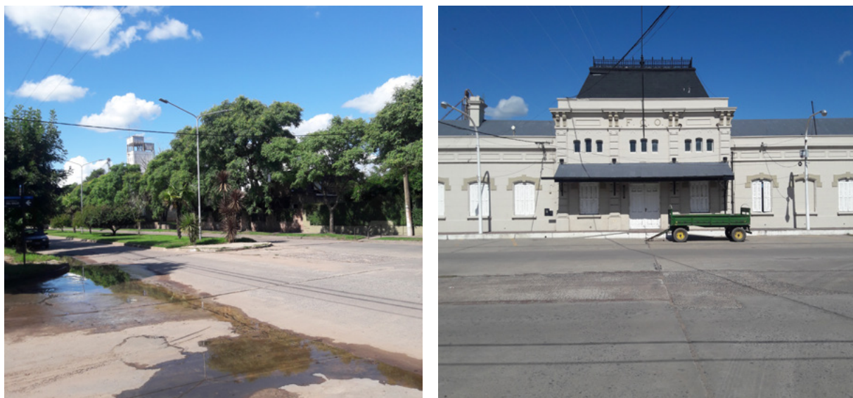
Figure 17, 18: Pehuajo, Argentina

perience as well as the local and regional collaborations that have been set up.