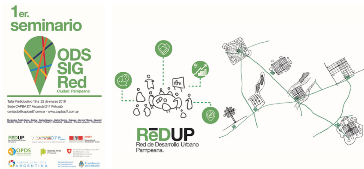
Figure 15, 16: Flyer for workshop in Pehuajó-2019, Pampeana Urban Development Network

jectives of promoting knowledge sharing and experimentation at the regional level, pooling resources and developing appropriate tools and training for municipal technicians.