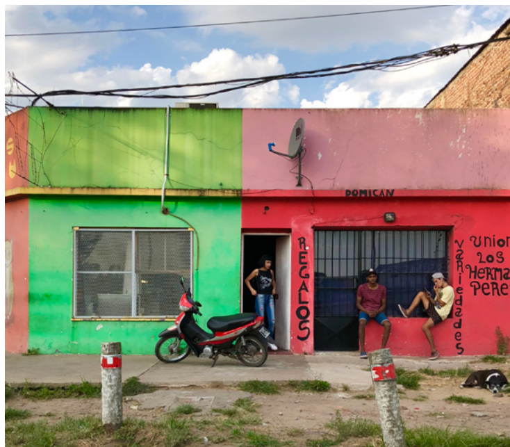
Figure 8: Nueve de Julio, Argentina

neighborhoods. However, it is also an extraordinary opportunity to think about the future based on what exists, taking into account the actual financial and social resources of these cities, to design and implement urban planning that fights against poverty, and to invest in facilities with a sustainable impact on the poor's living conditions.