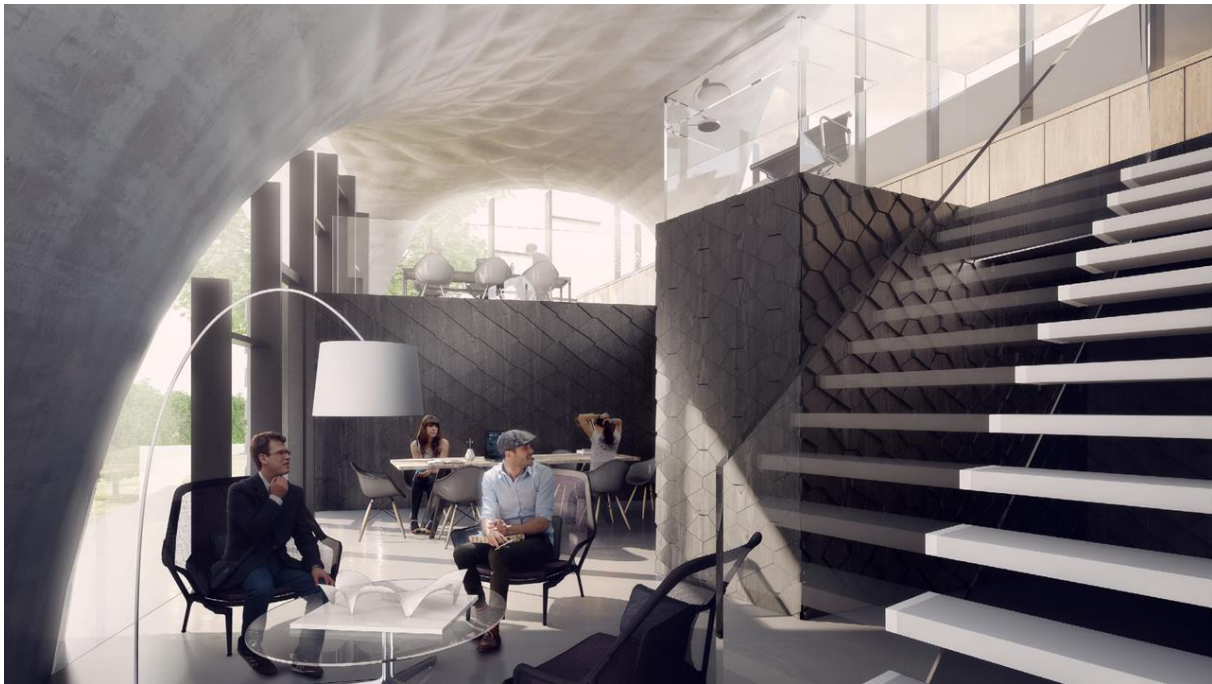
Figure 4: Rendering of the Interior of the HiLo Module.

A numerical study of the single shell roof showed that the edge losses were in excess of the amount recommend in SIA 380/1. Due to the concrete element thickness and the related structural issues, traditional methods such as thermal breaks or concrete mixes with insulation pearls (expanded polystyrene) could not be readily employed to insulate the concrete shell. This is especially true in regions with large overhangs.