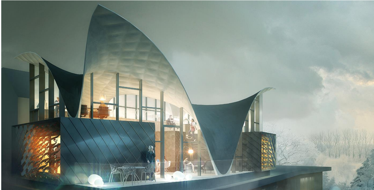
Figure 1: Rendering of the exterior of the HiLo module.

HiLo is planned as an energy-plus module in operation phase and will be equipped with sensors providing a stream of thermal, lighting, energy consumption and external environment data. HiLo is currently at an advanced design phase, and is due to commence construction in early 2016.