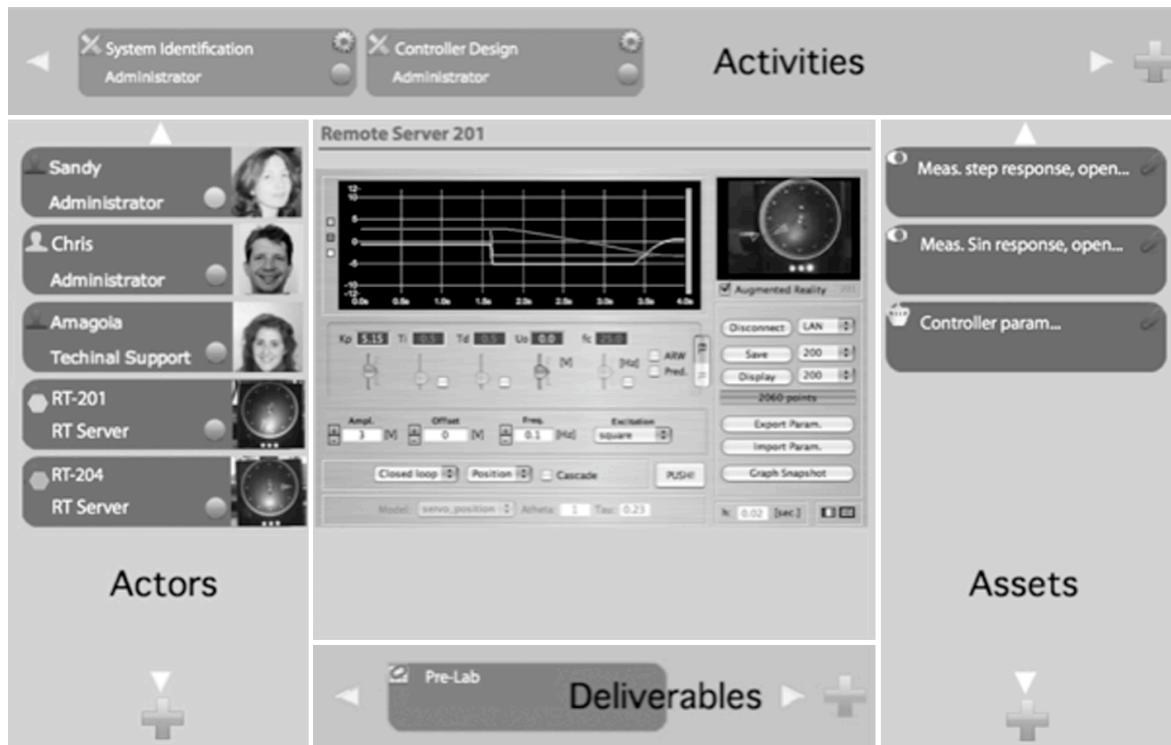
Fig. 3. The eLogbook contextual view showing an experiment as the central element with the related actors (left-hand side area) of the associated laboratory activities (upper area) together with relevant assets (right-hand side area).

The eLogbook social software can be considered as a contextual aggregator and navigator. Its context-sensitive view (Fig. 3) consists of a central element defining the context surrounded by three main regions dedicated to activities, actors and assets respectively. When an entity is selected as the context and displayed as the central element, the surrounding areas are updated to display the entities related to it along with their relations and the associated actions that actors can perform.